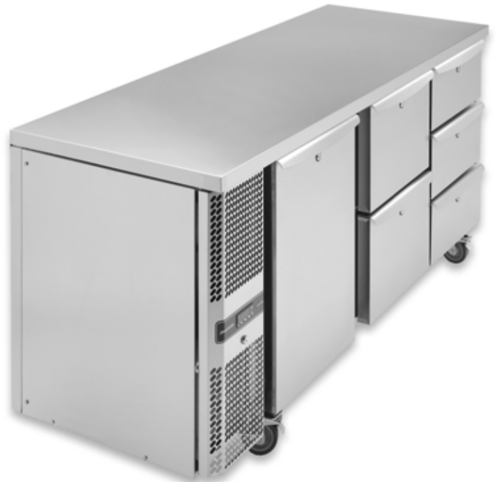
shows optional drawer sets

The self contained side-mounted refrigeration system draws and vents from the front allowing the counter to be built-in to your kitchen. Defrost is automatic and our energy saving vapouriser eliminates the need for a drain